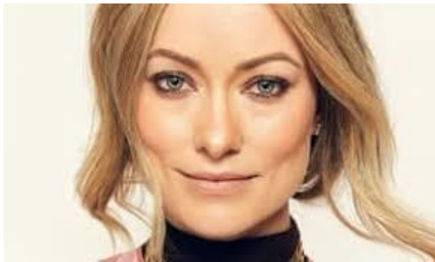
'Booksmart' director Olivia Wilde

'Booksmart' director Olivia Wilde called attention to the edited version of her film on Twitter.